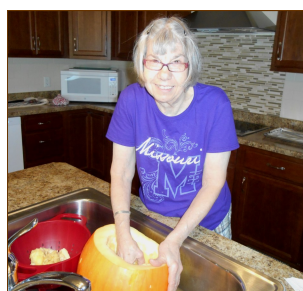
Working with pumpkins from our own pumpkin patch. Great for cooking and fall decorating!