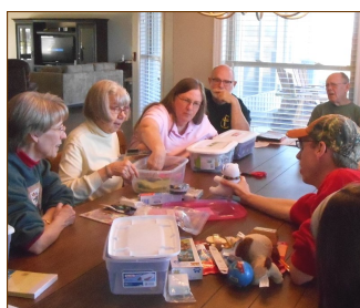
Volunteers from Ridgecrest help with Operation Christmas Child.

Volunteers make our world go 'round! Thank you!