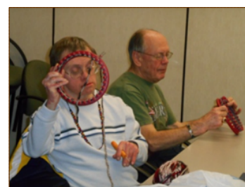
Using newly-learned skill of loom knitting to participate in Hats for the Homeless at The Library Center

Volunteers make our world go 'round! Thank you!