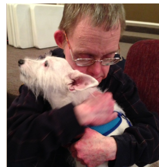
Pet Therapy during Sunday school at Ridgecrest Baptist Church